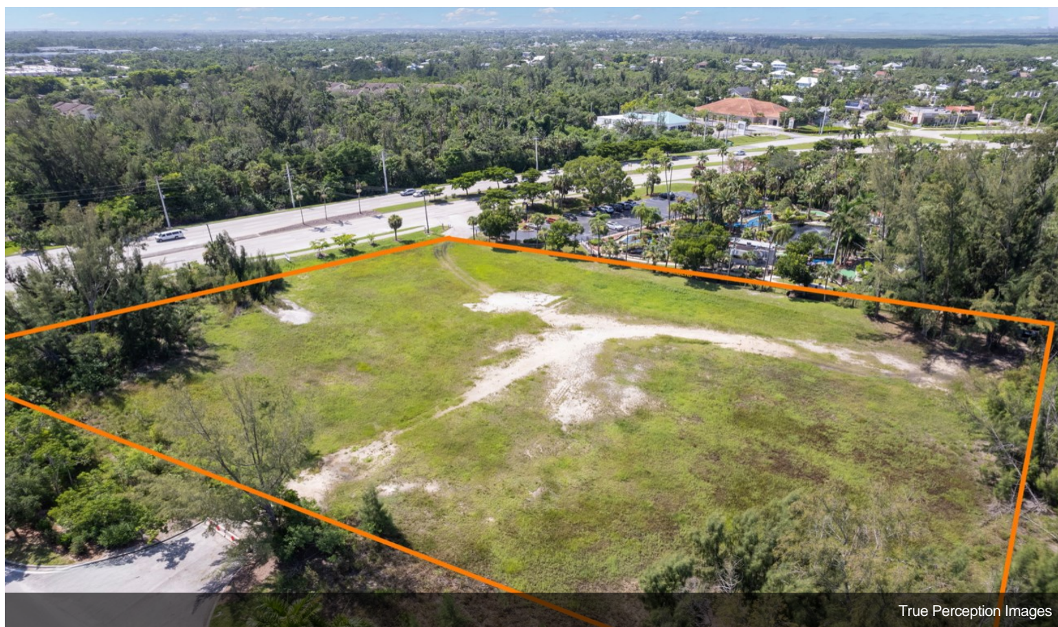
True Perception Images