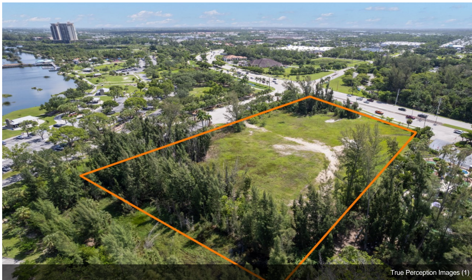
True Perception Images (1)