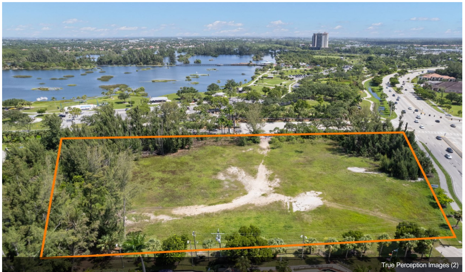
True Perception Images (2)