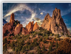
Garden of the Gods - National Natural Landmark