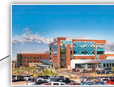
Children's Hospital Colorado