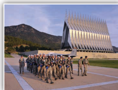
Air Force Academy