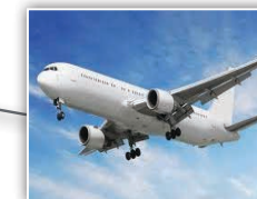
Colorado Springs Municipal Airport

The information contained herein, while from sources believed reliable, is not guaranteed and is subject to change without notice. NAI Affinity makes no warranties or representations as to the accuracy of this information. This brochure is the exclusive property of NAI Affinity. Any duplication without NAI Affinity's express written consent is prohibited.