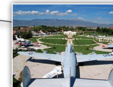
Peterson Space Force Base