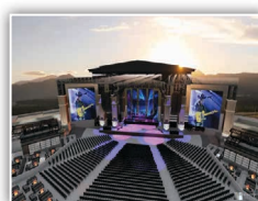
The Sunset- 8,000 seat outdoor amphitheater (2024)