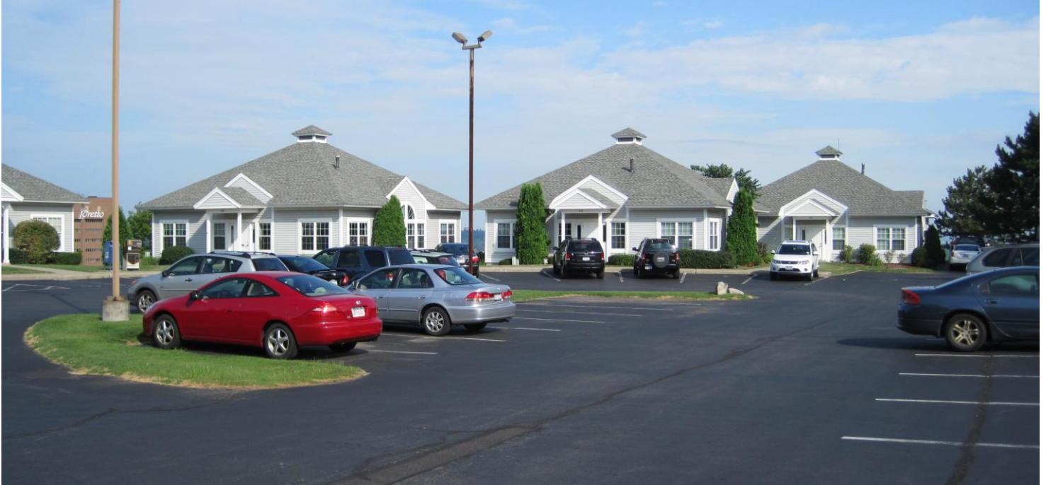
Brighton Hill Office Park – Small 4 Building Office Complex