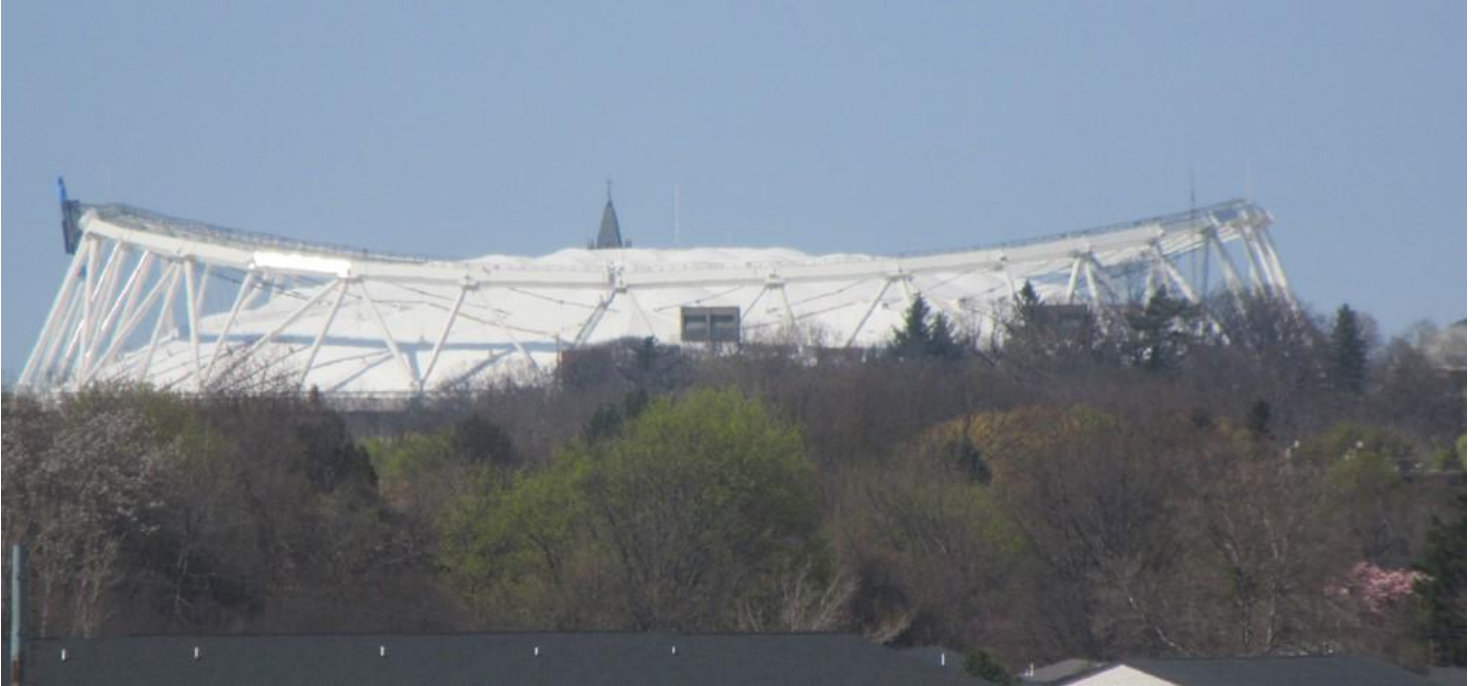
Close to Syracuse University