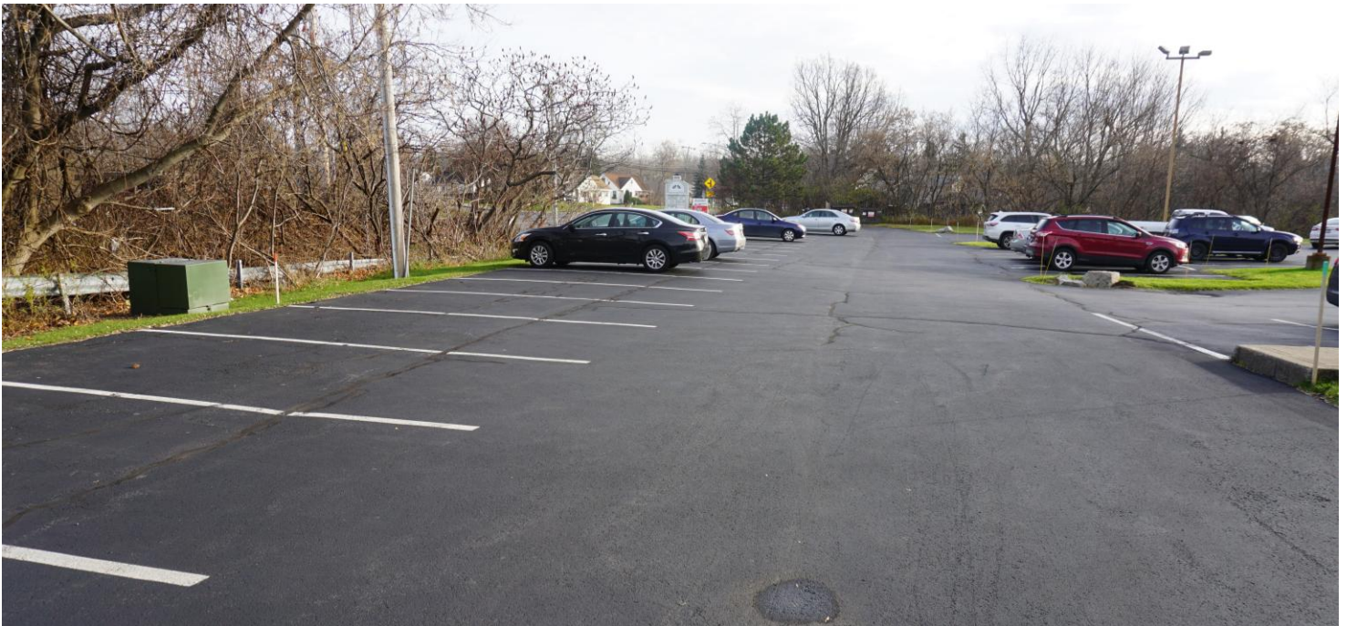
Plenty of Parking