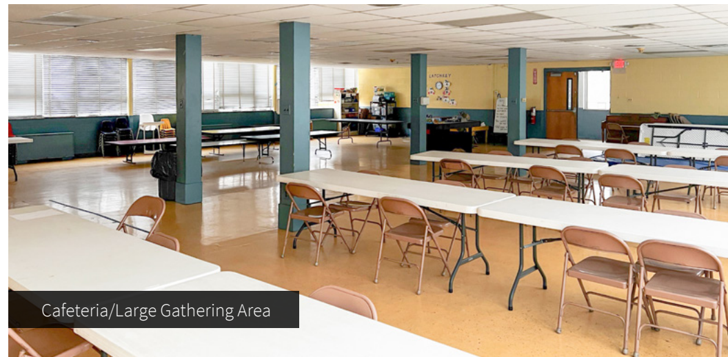
Cafeteria/Large Gathering Area