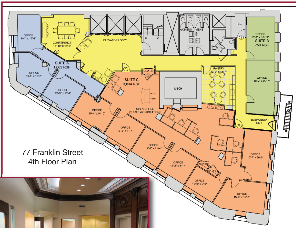
77 Franklin Street 4th Floor Plan