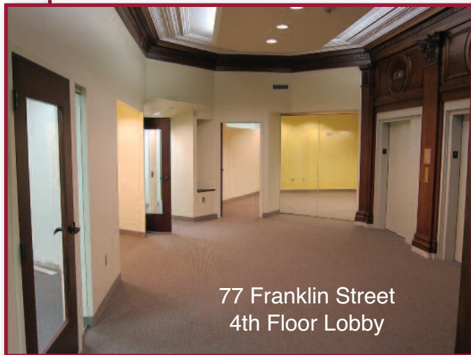
77 Franklin Street 4th Floor Lobby