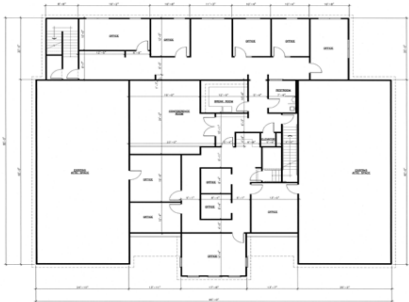
① SECOND FLOOR PLAN