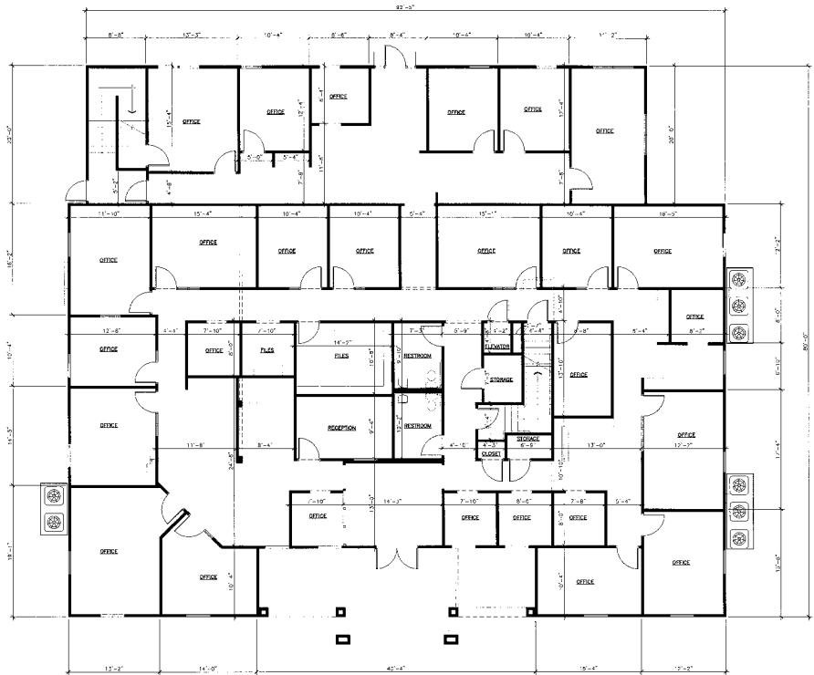
① FIRST FLOOR PLAN