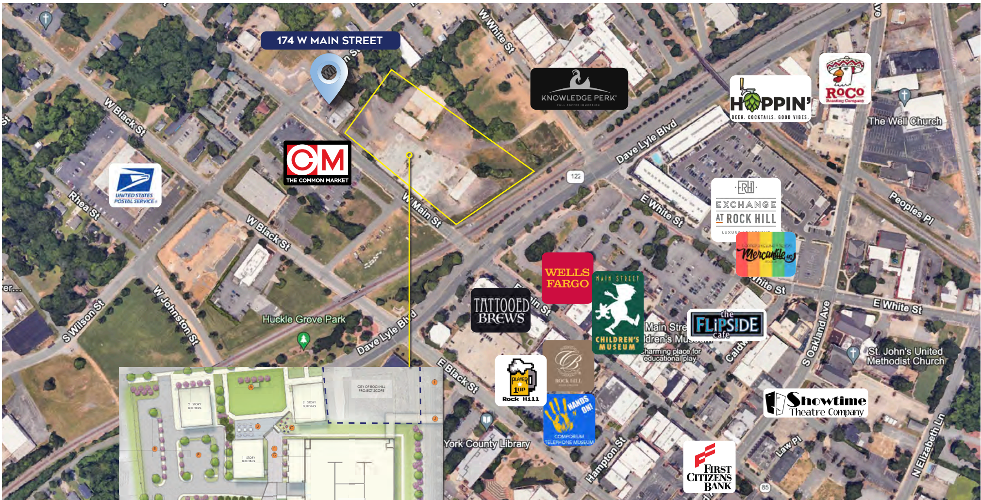
ROCK HILL HERALD DEVELOPMENT RENDERING