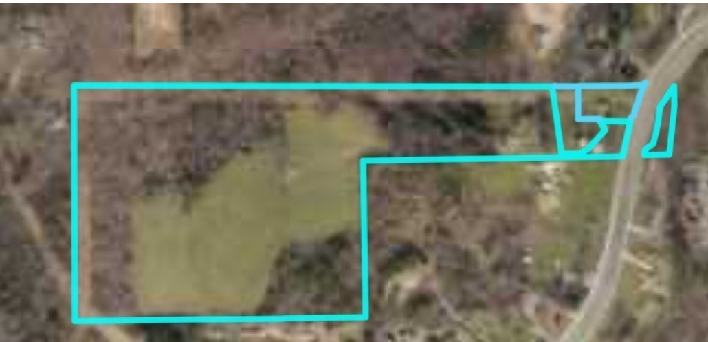
Three Parcels - 39.18 Acres Total