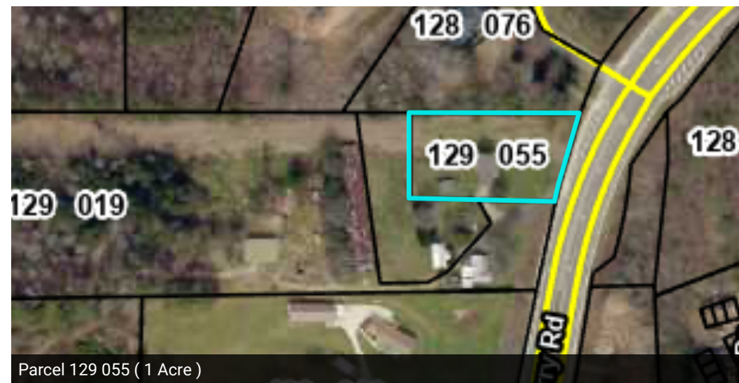
Parcel 129 055 ( 1 Acre )