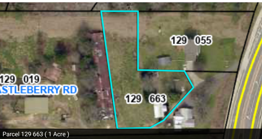
Parcel 129 663 ( 1 Acre )