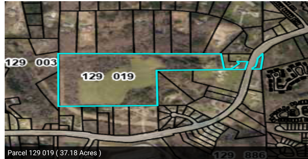
Parcel 129 019 ( 37.18 Acres )