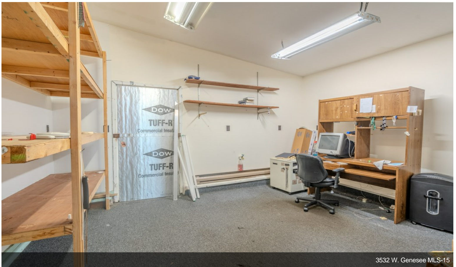
3532 W. Genesee MLS-15