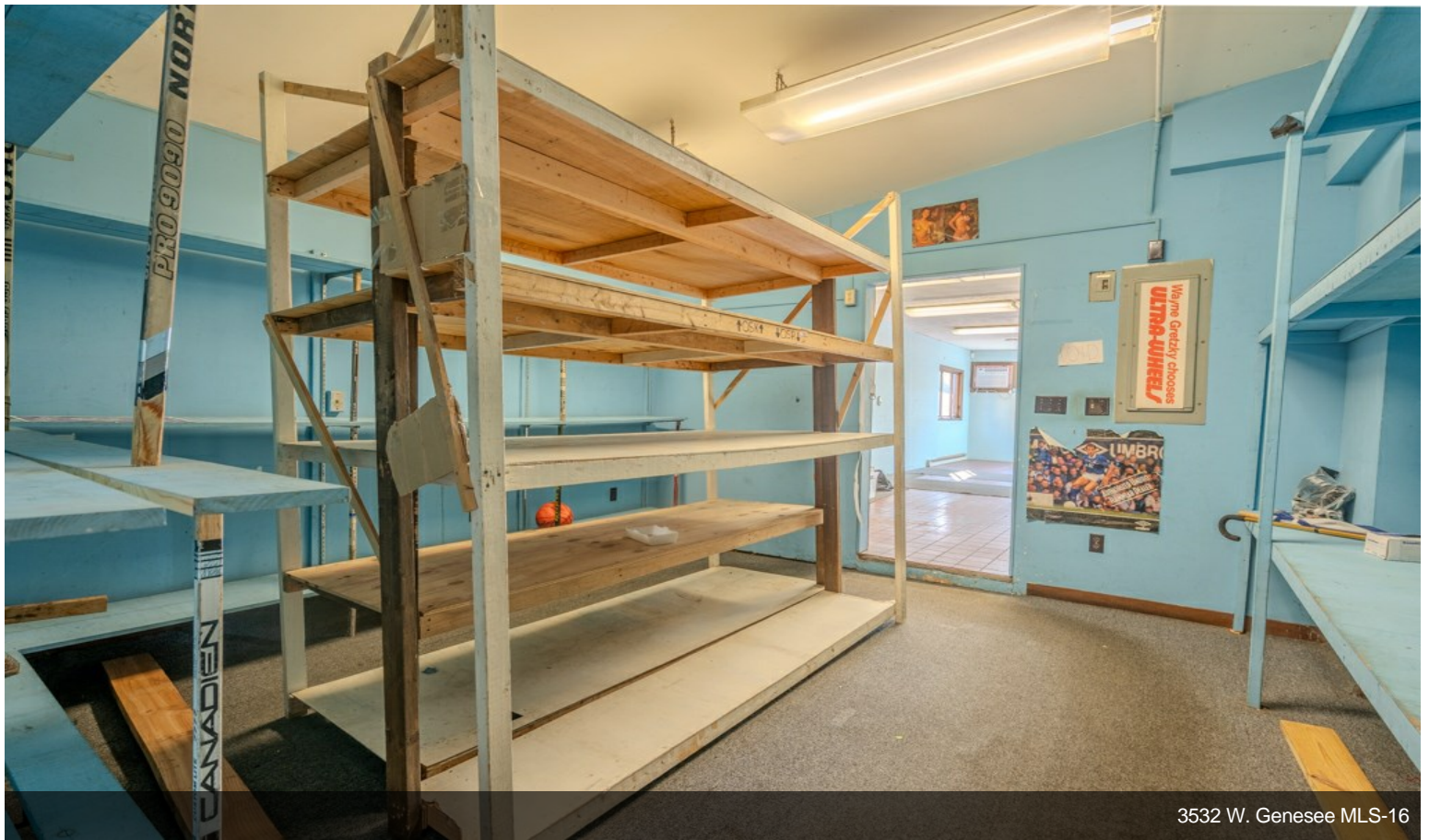
3532 W. Genesee MLS-16