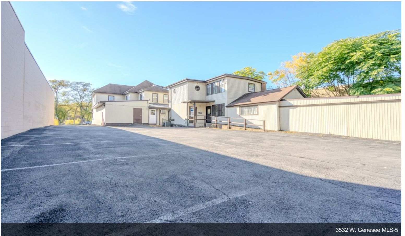
3532 W. Genesee MLS-5