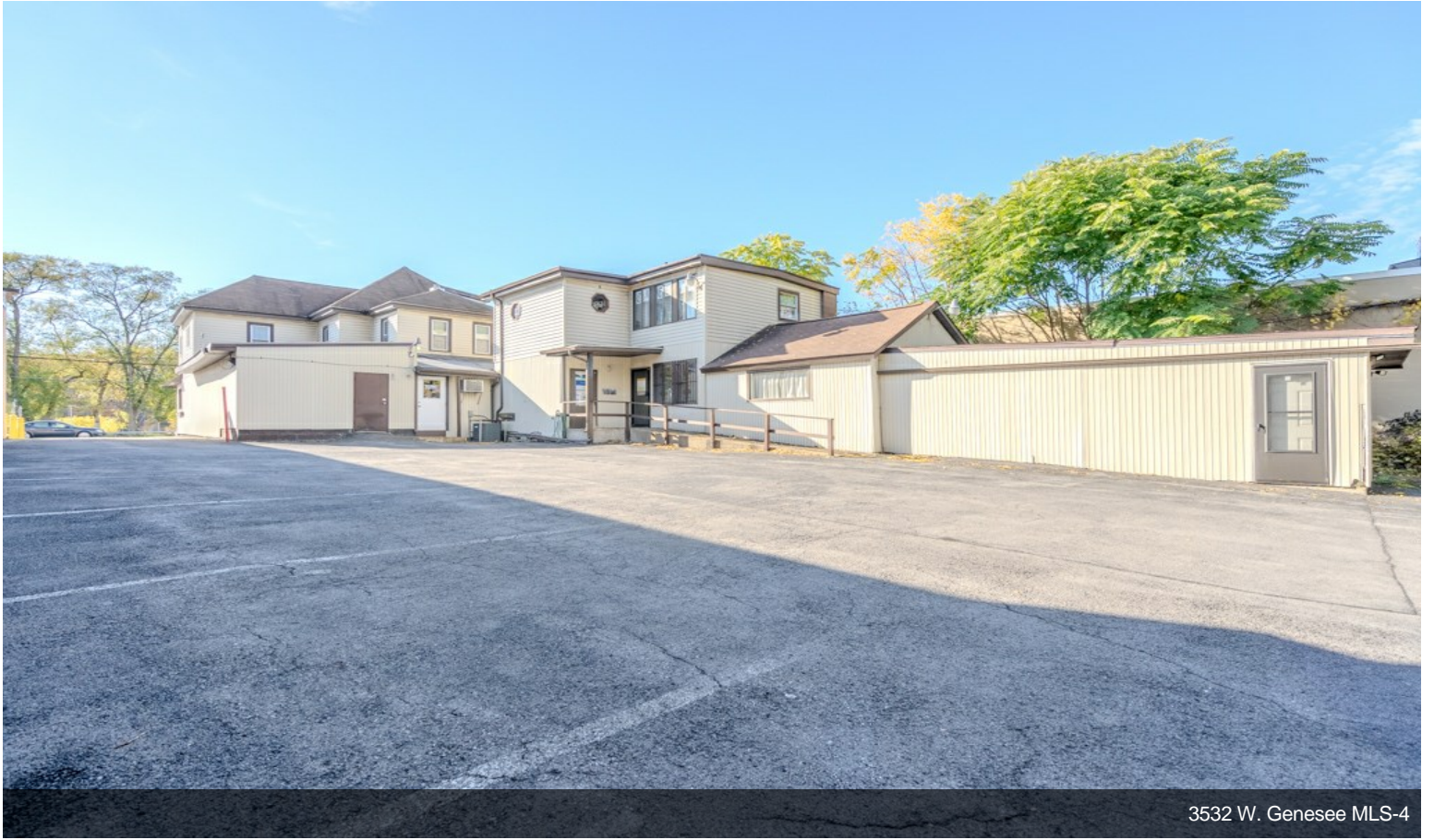
3532 W. Genesee MLS-4