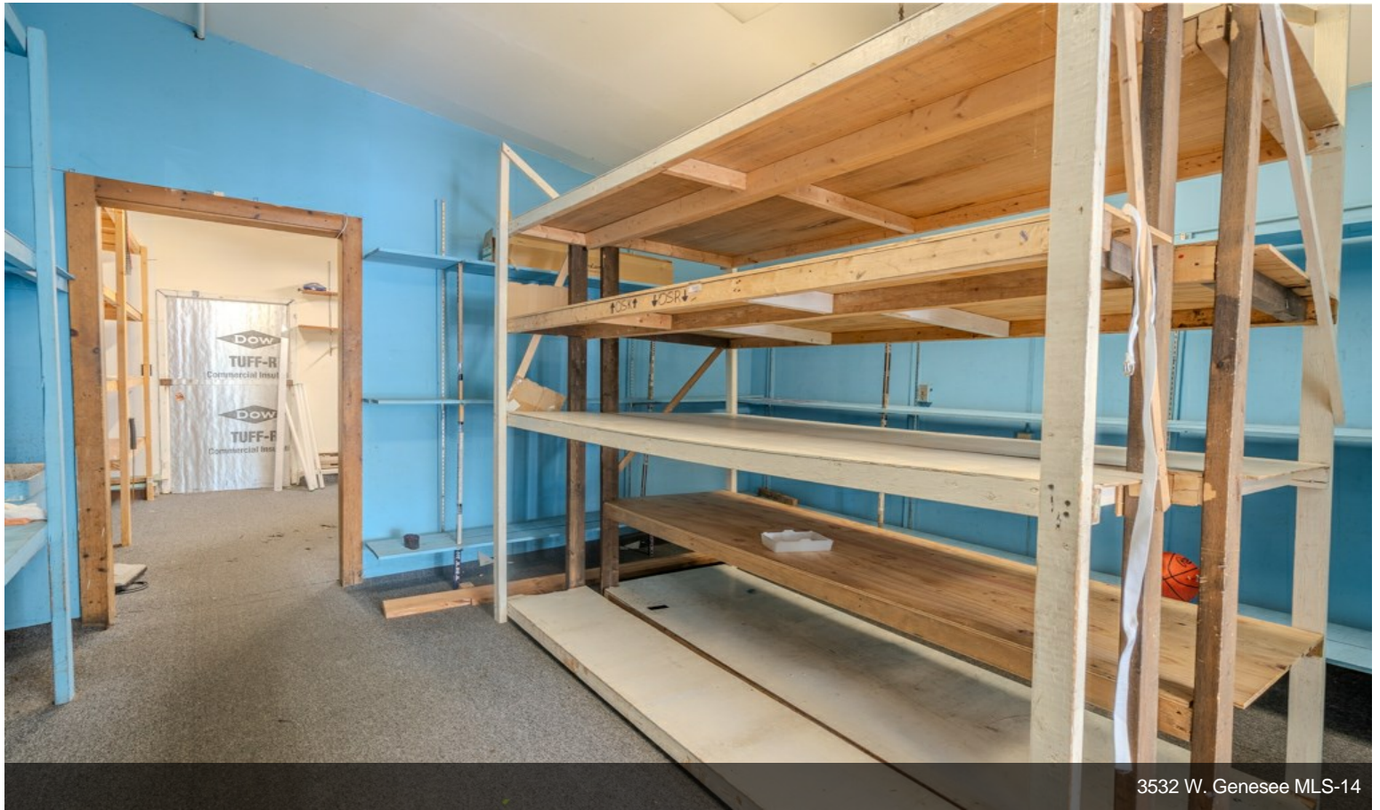
3532 W. Genesee MLS-14