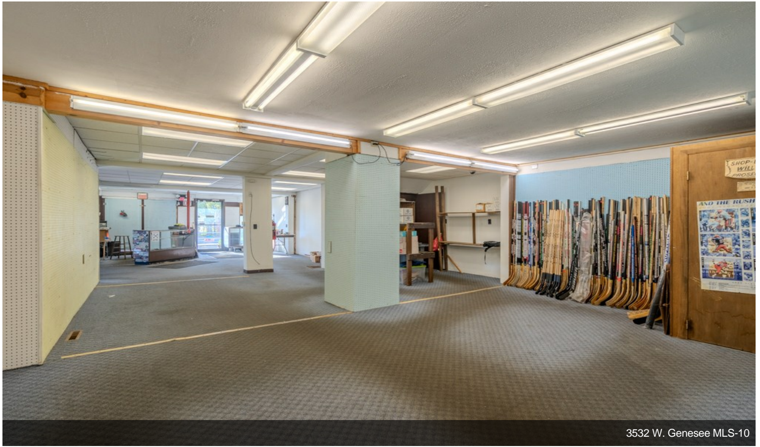
3532 W. Genesee MLS-10