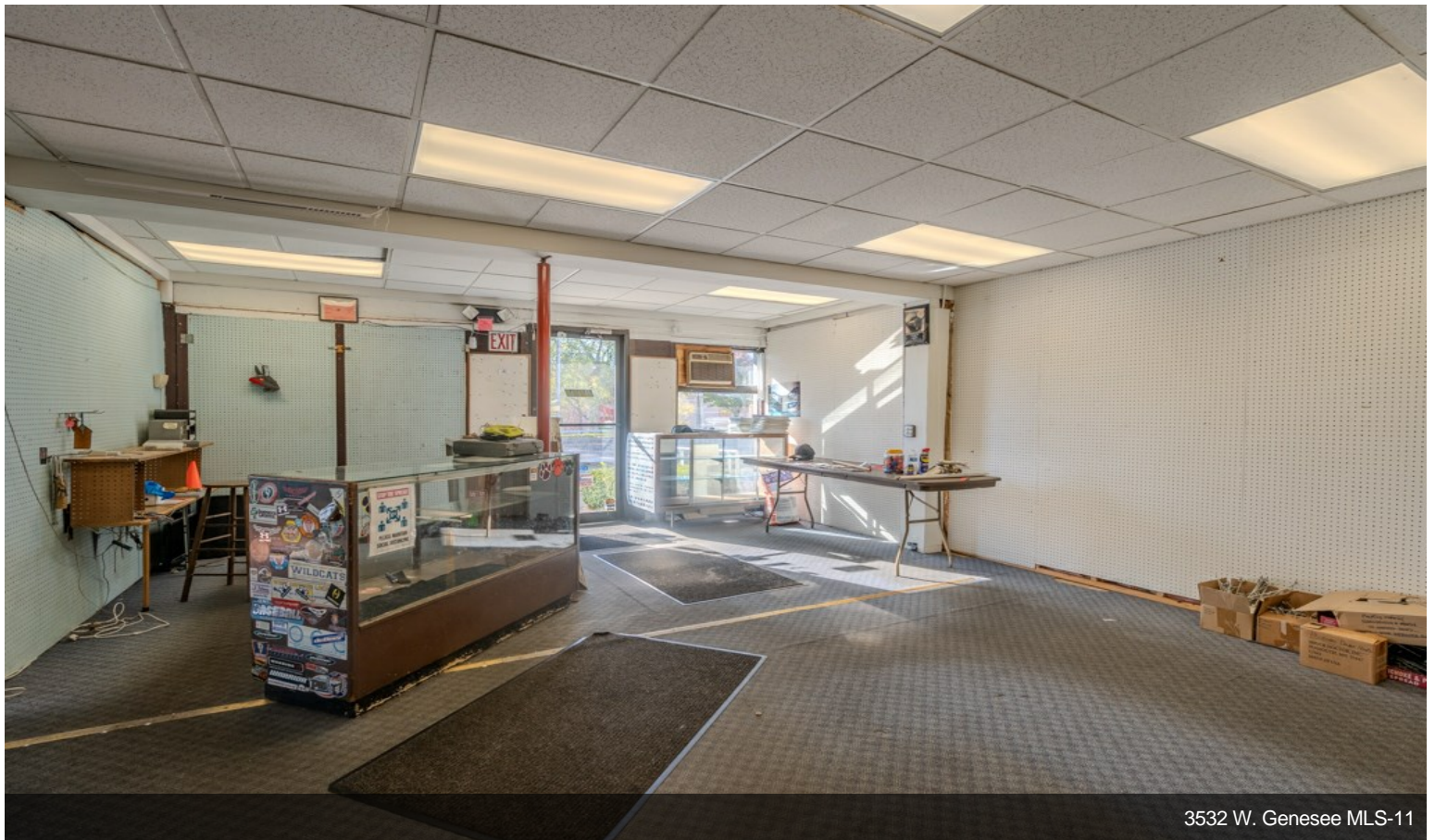
3532 W. Genesee MLS-11