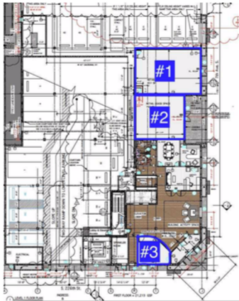
Ground Floor Layout