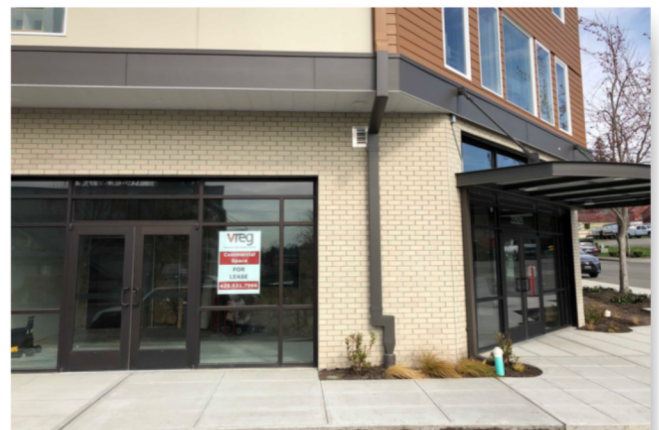
Space #3 Directly Next to Grand Entrance