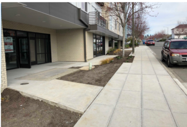
Street Frontage for Spaces #1 & #2