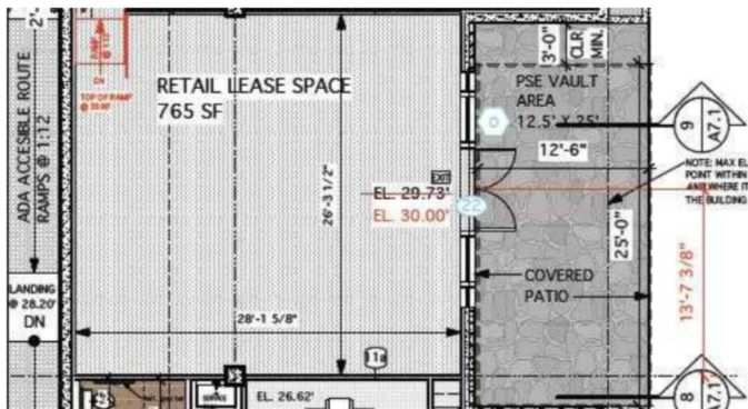
Space #2: 775 SF