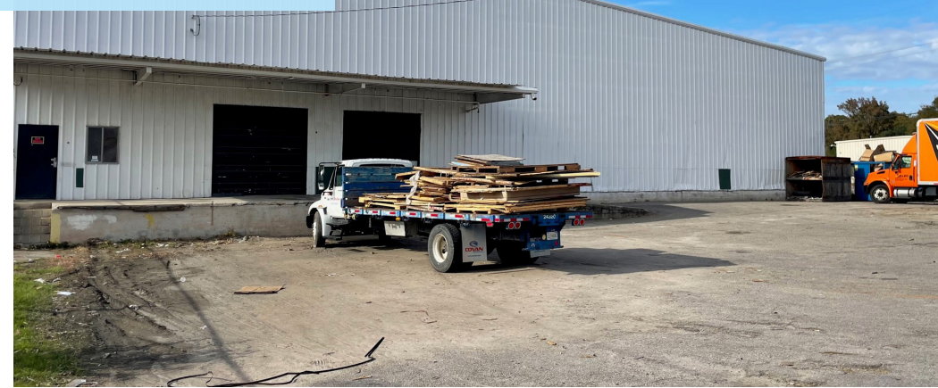
2720 Commerce Dr.