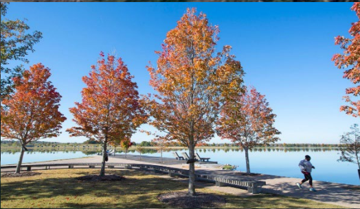
Hyde Lake Boat Launch