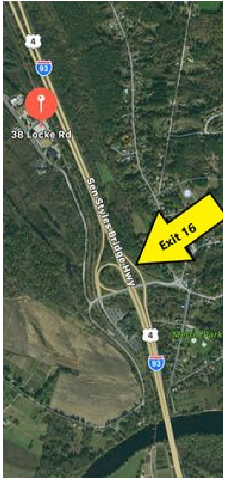
Close to Exit 16, I93