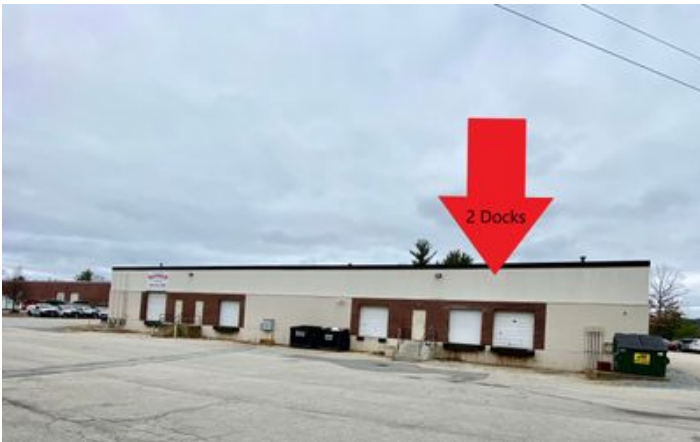
2 Docks back of building (1)