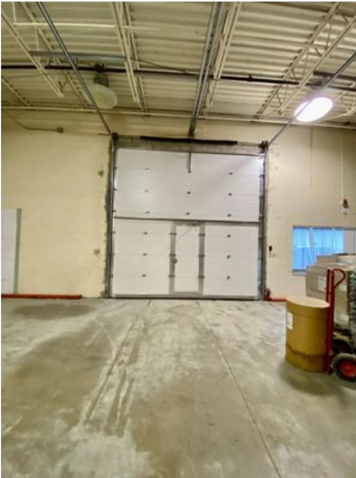
OH Door 14'