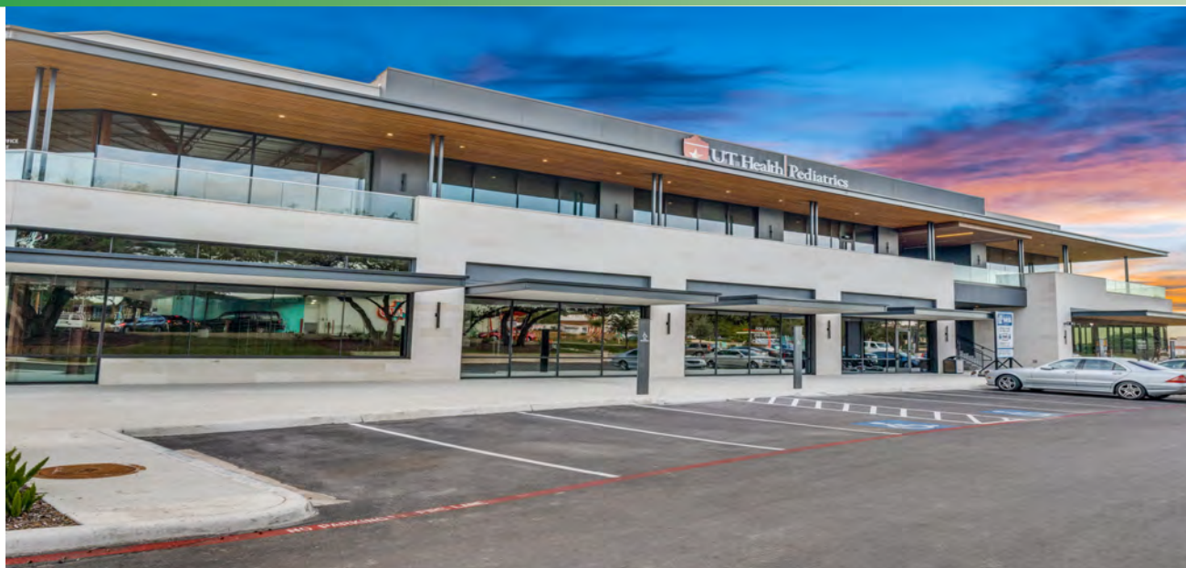
GATEWAY MEDICAL CENTER MIXED-USE DEVELOPMENT

FOR LEASE Gateway Medical Center Phase I 8435 Wurzbach Parkway San Antonio, TX 78229