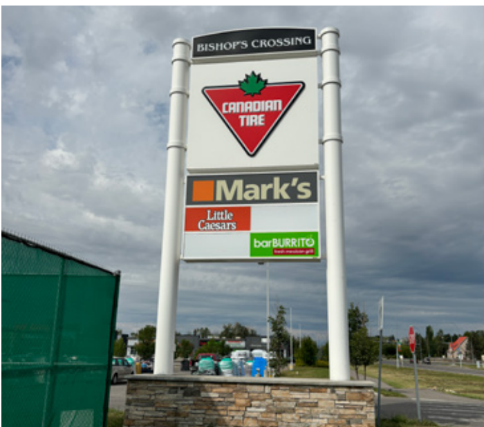
Pylon Signage Available on 12th Avenue SE