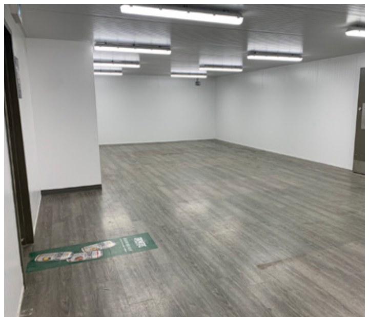
Available Unit - Interior shot - Bishop's Crossing is anchored by Canadian Tire