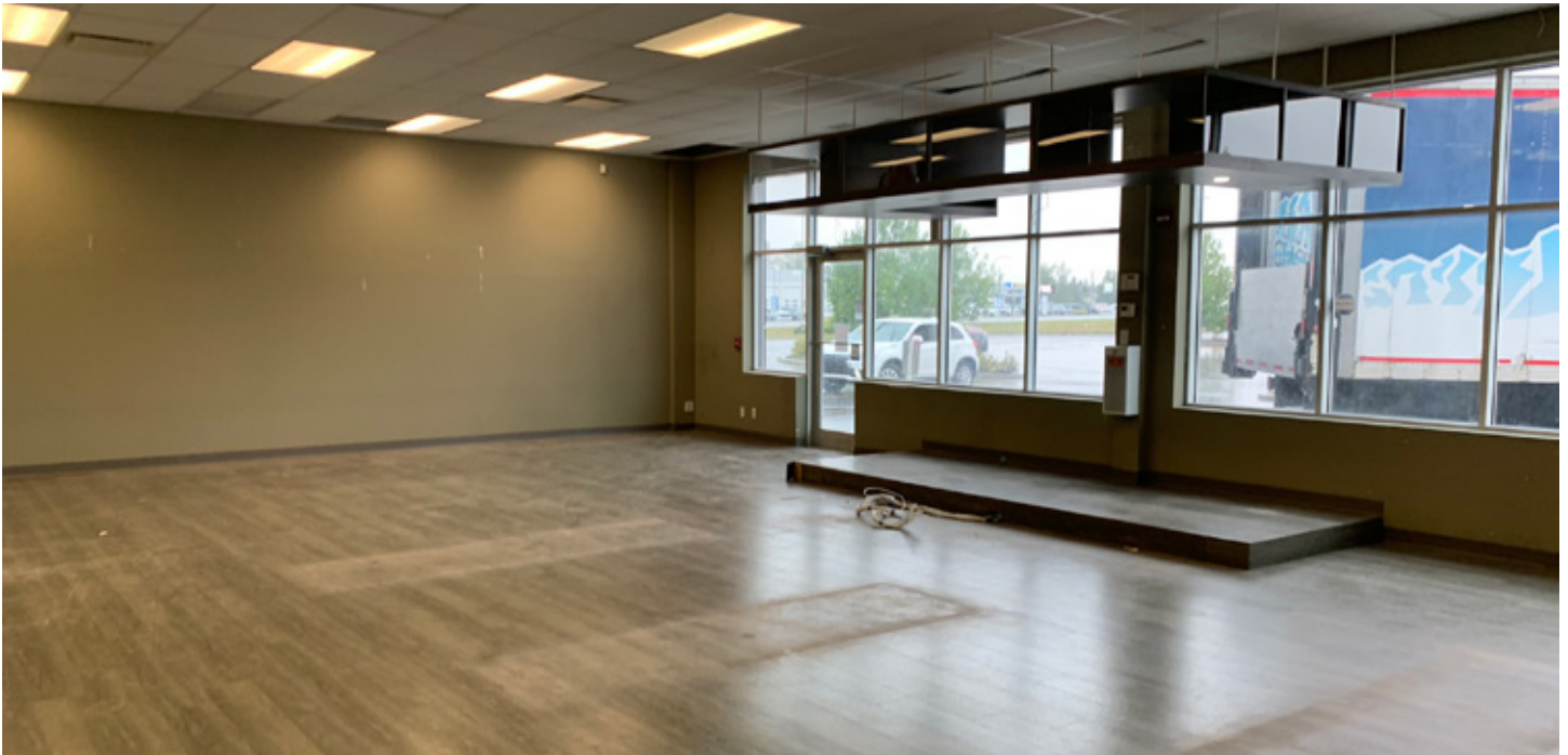
Available Unit - Interior shot - Bishop's Crossing is anchored by Canadian Tire

For Lease — Bishop's Crossing High River