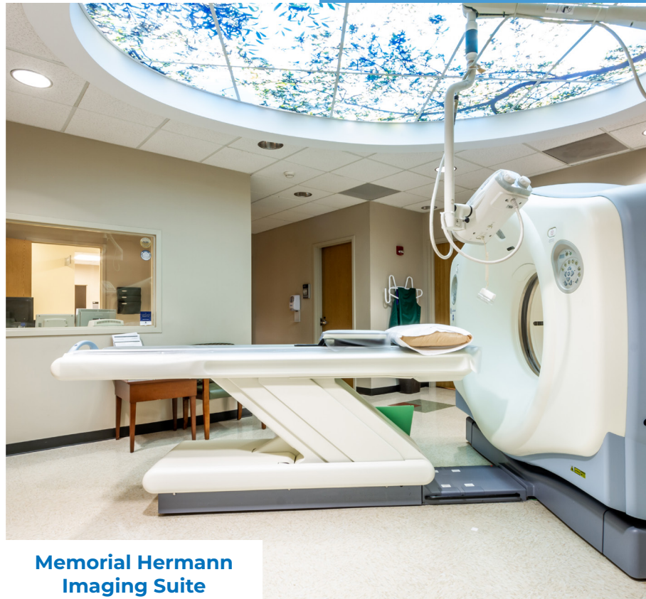
Memorial Hermann Imaging Suite