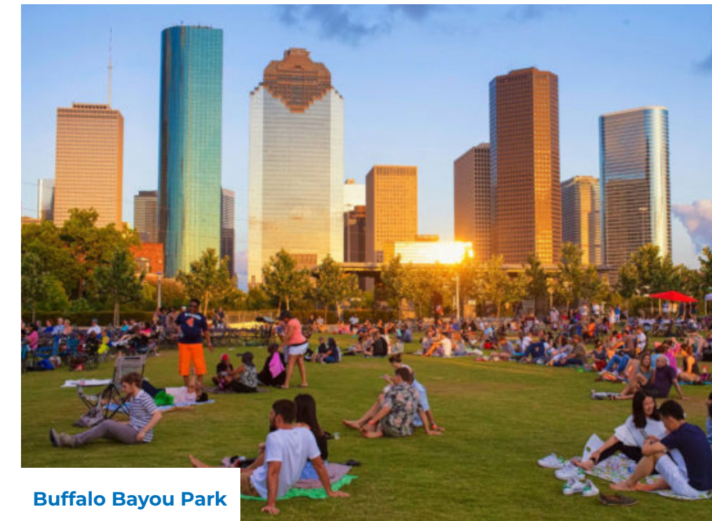
Buffalo Bayou Park