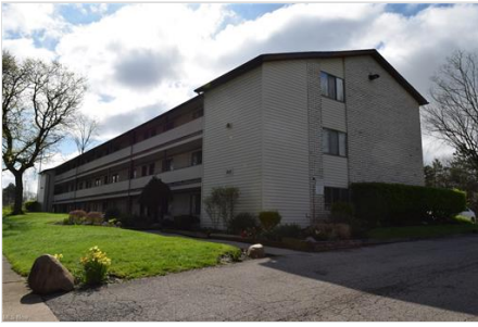
Front of Structure

Apartment SqFt: 0 Bsmt: No Yr: 1977 Acres: 0.92 $1,560,000