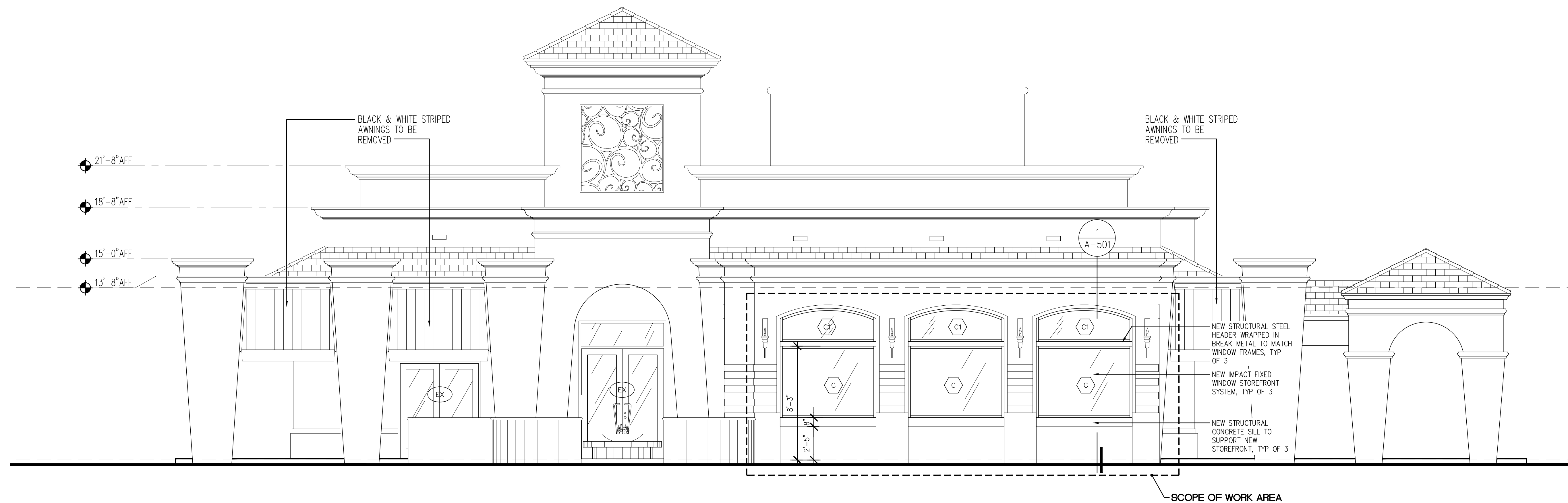
PROPOSED WEST ELEVATION 1/4" = 1'-0" 1