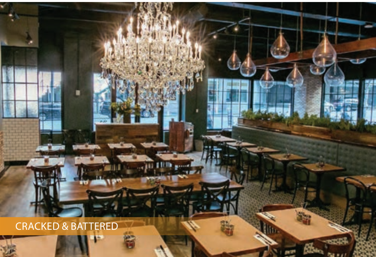
CRACKED & BATTERED