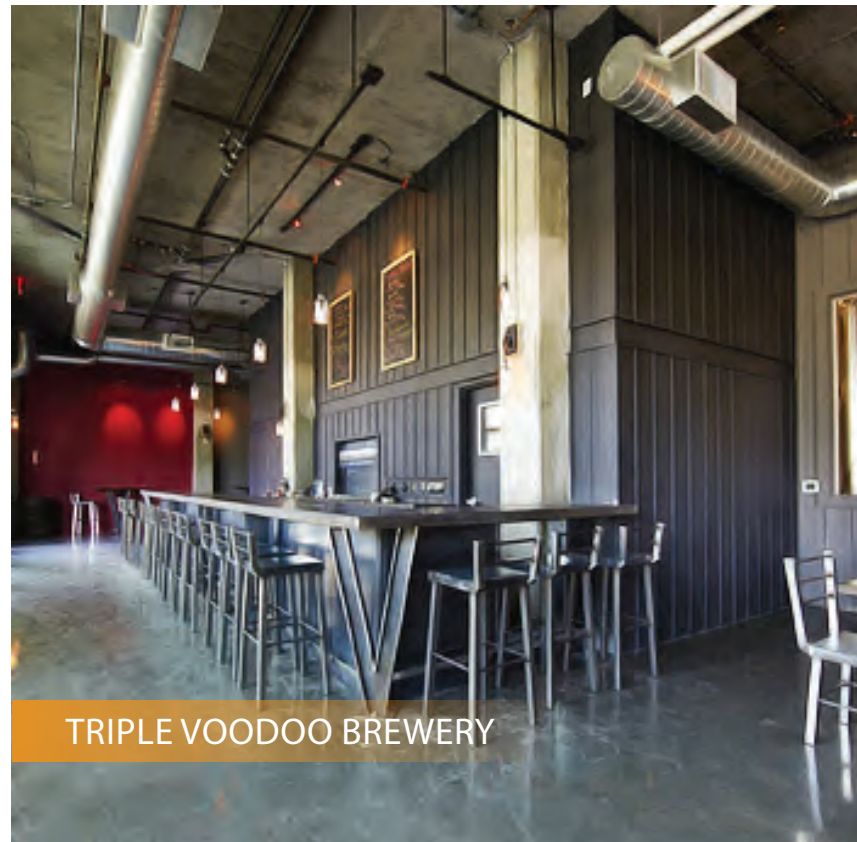
TRIPLE VOODOO BREWERY