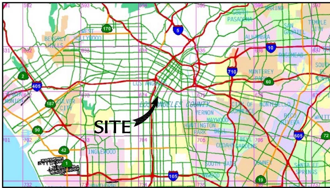
VICINITY MAP NO SCALE