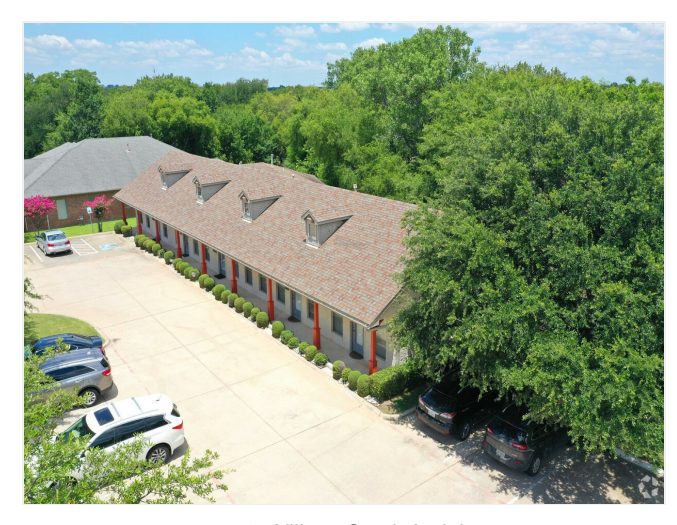
5309 Village Creek Aerial