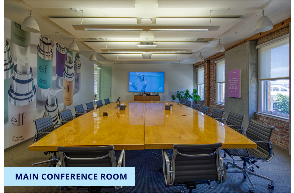
MAIN CONFERENCE ROOM