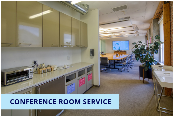
CONFERENCE ROOM SERVICE