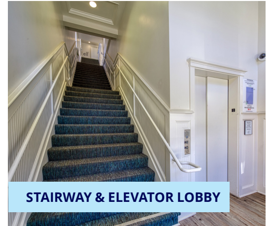
STAIRWAY & ELEVATOR LOBBY