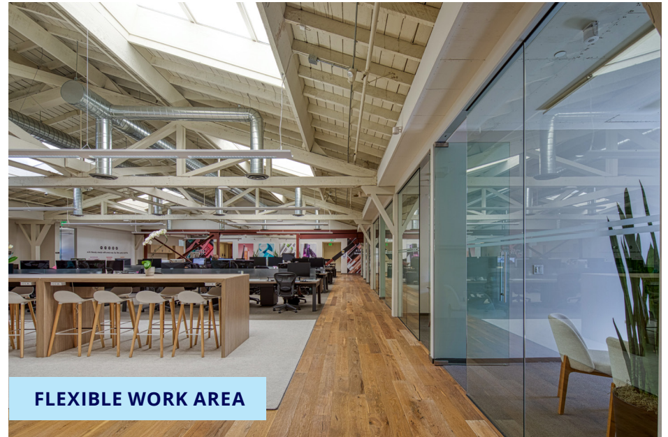
FLEXIBLE WORK AREA