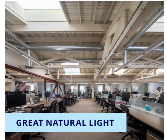
GREAT NATURAL LIGHT