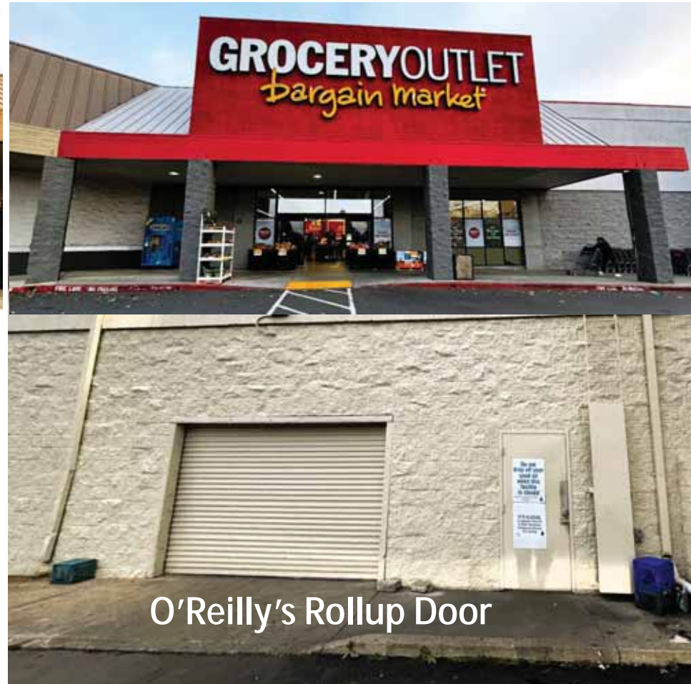
O'Reilly's Rollup Door