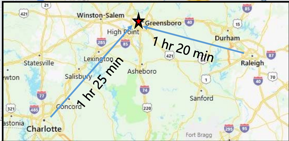
Drive Times from Raleigh and Charlotte