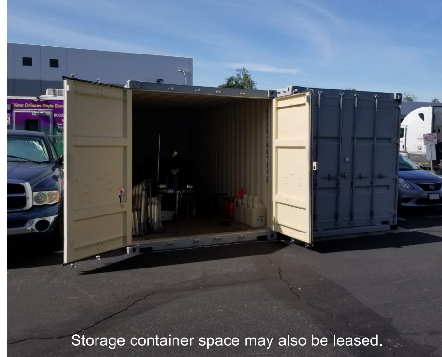
Storage container space may also be leased.