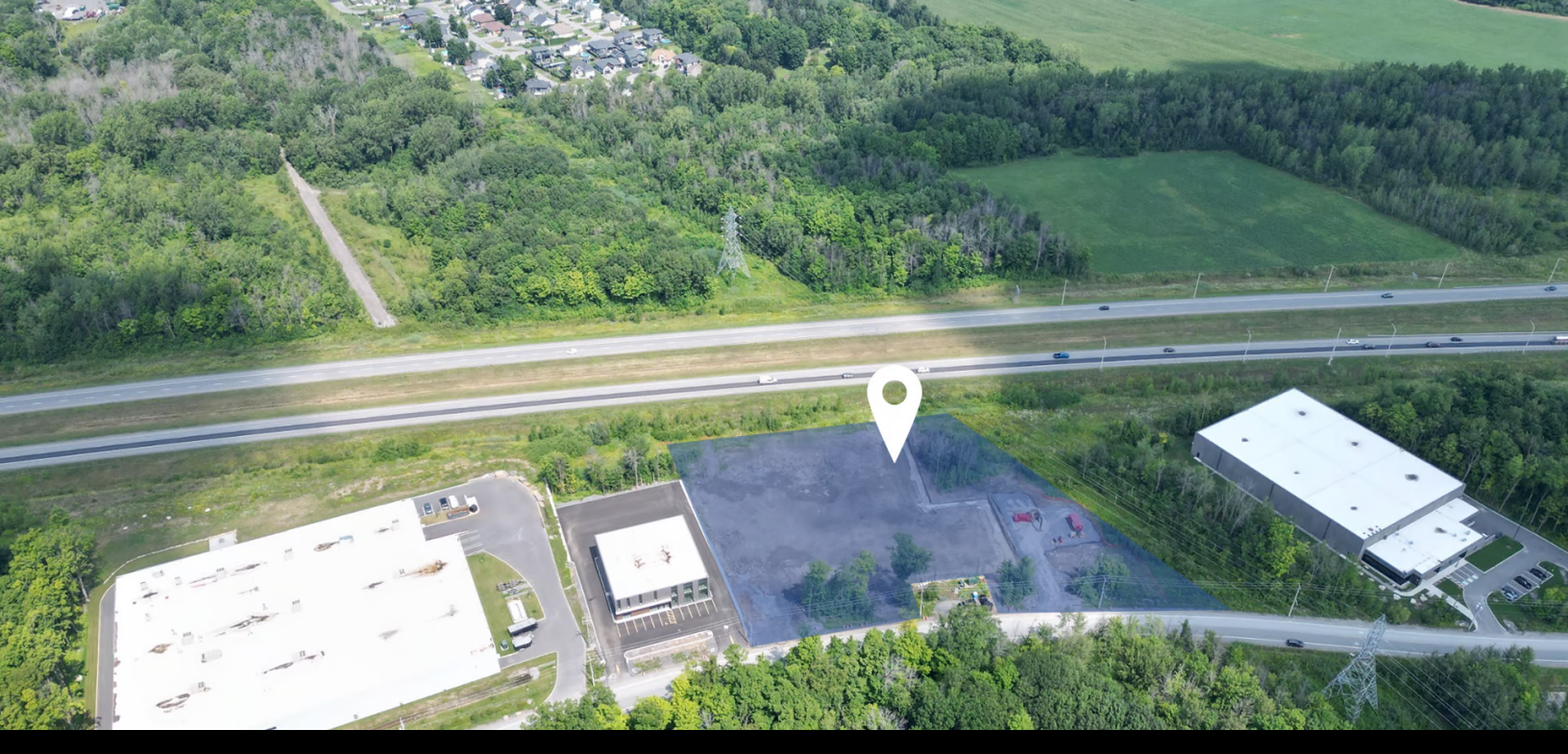
Condo industriel #3 Pierre-Dansereau, Salaberry-de-Valleyfield