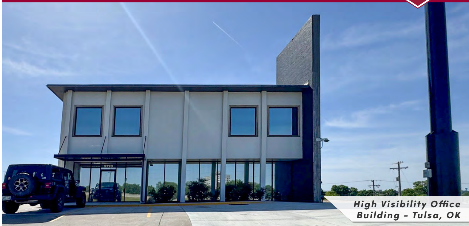
High Visibility Office Building - Tulsa, OK