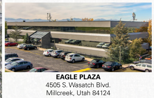
EAGLE PLAZA 4505 S. Wasatch Blvd. Millcreek, Utah 84124