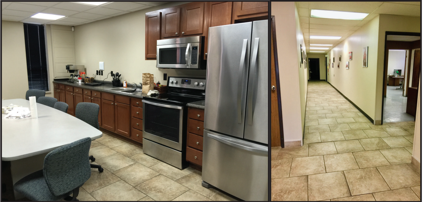
Interior Office Photos