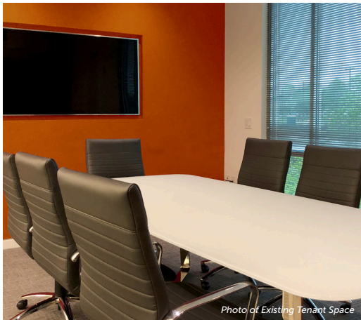
Photo of Existing Tenant Space