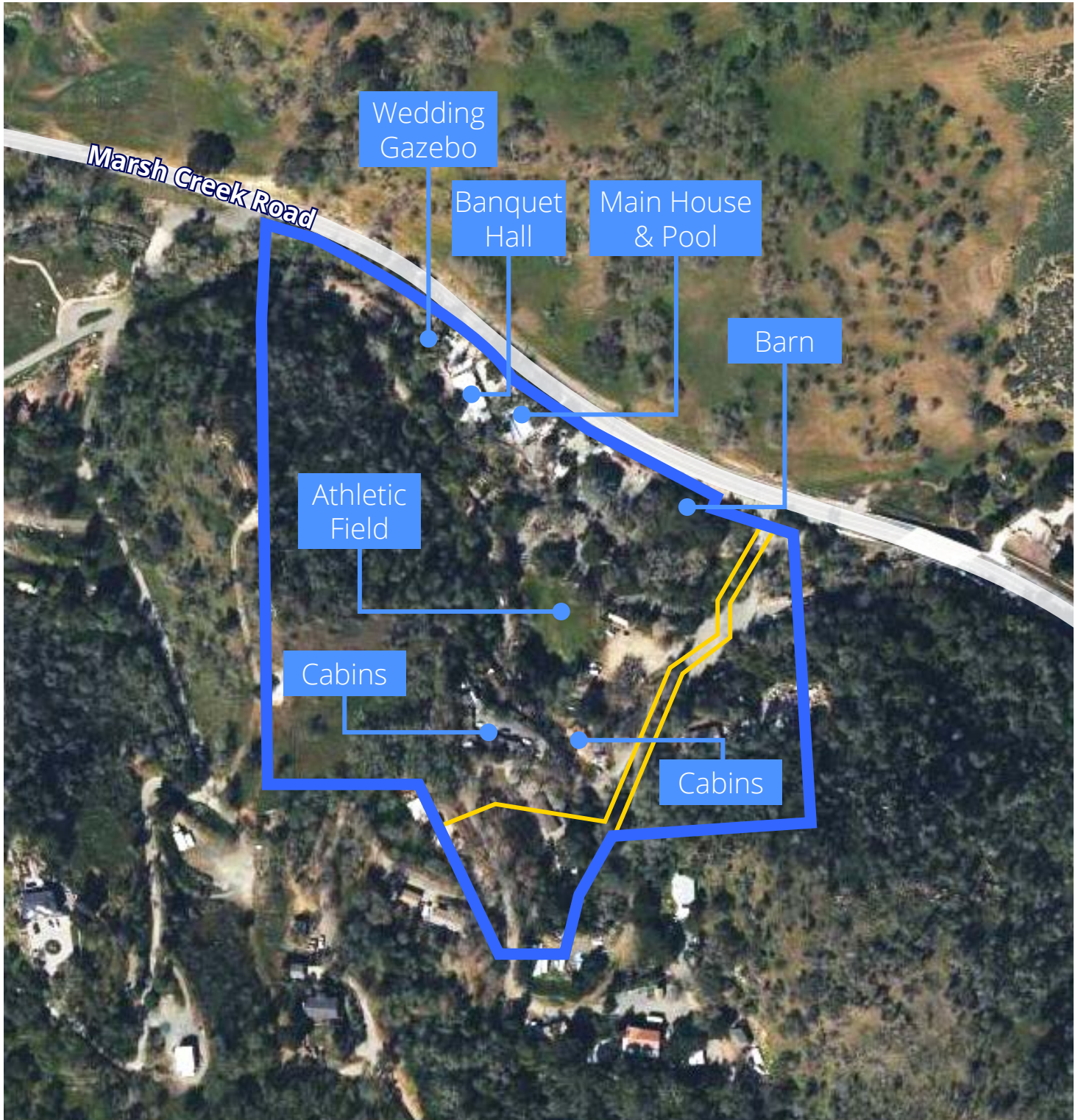
— Adjacent Property Easement