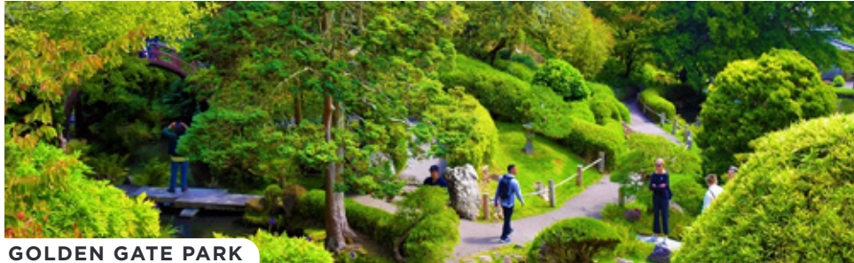
GOLDEN GATE PARK