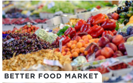
BETTER FOOD MARKET