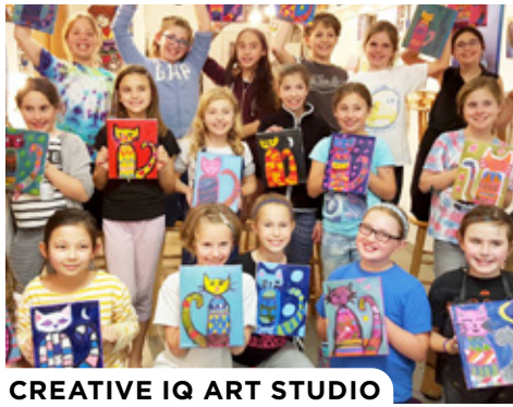
CREATIVE IQ ART STUDIO