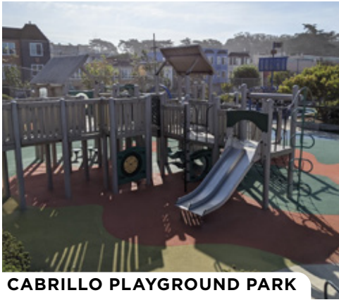
CABRILLO PLAYGROUND PARK