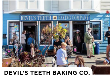
DEVIL'S TEETH BAKING CO.