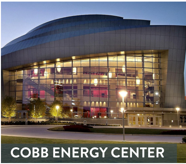
COBB ENERGY CENTER