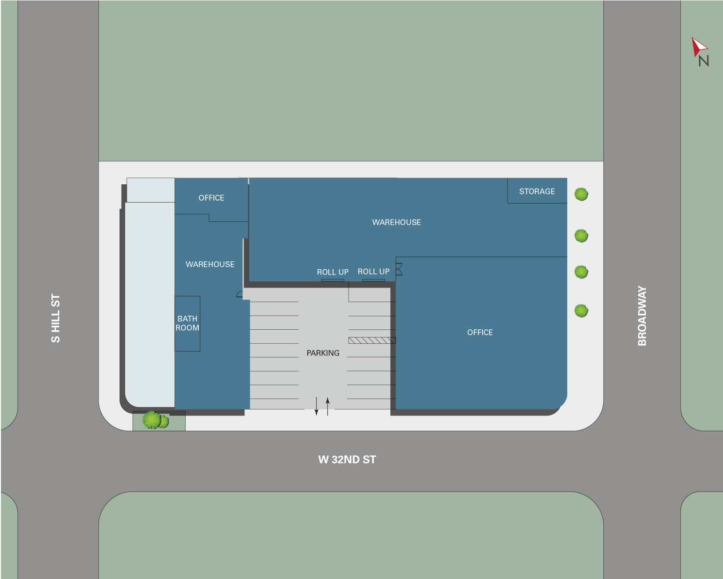
* The floor plan is for reference only. Actual layout and dimensions may vary.