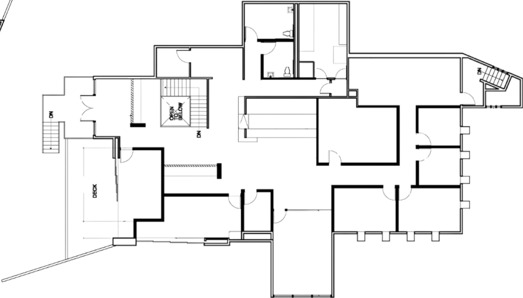
Second Floor 4,068 RSF