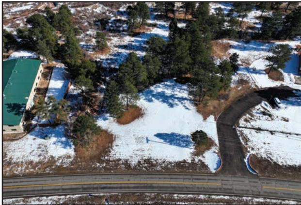
Boundary lines are for visual representation only and are not exact. Please contact broker for county records and legal description.

I-25 Exit 172: .50 Miles Larkspur Commercial Core .30 Miles