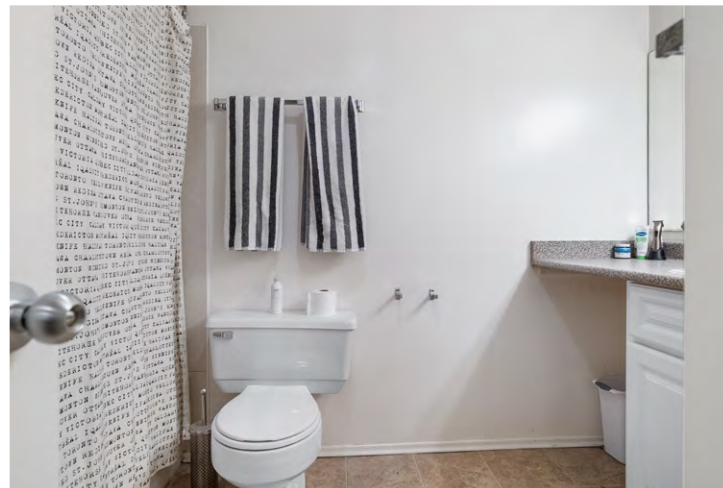
SUITE - BATHROOM