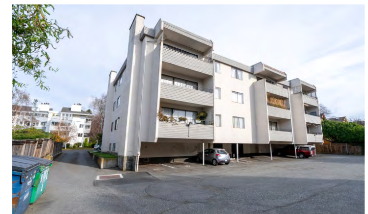
BACK OF BUILDING / PARKING