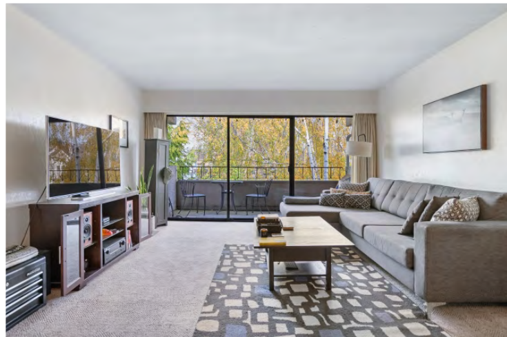
SUITE - LIVING ROOM