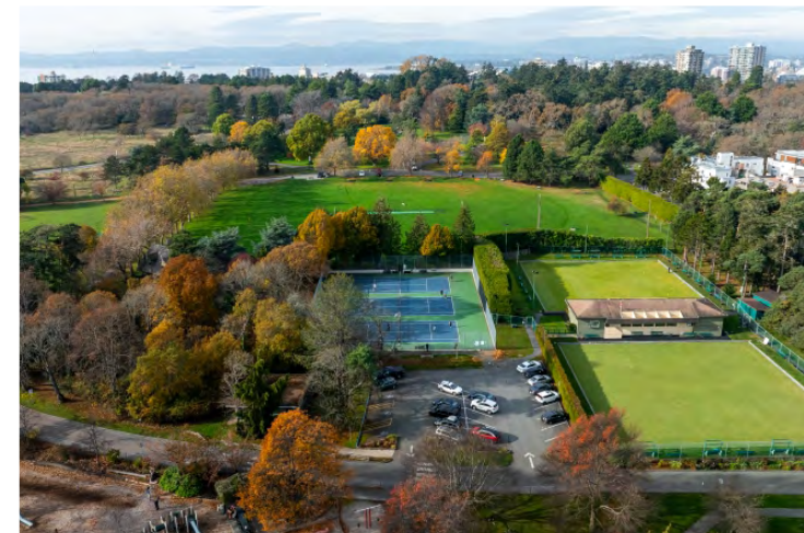
BEACON HILL PARK