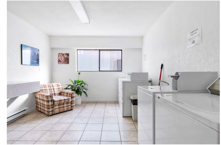
COMMON AREA - LAUNDRY