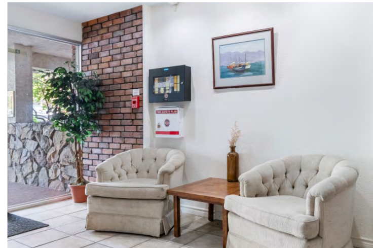
COMMON AREA - LOBBY