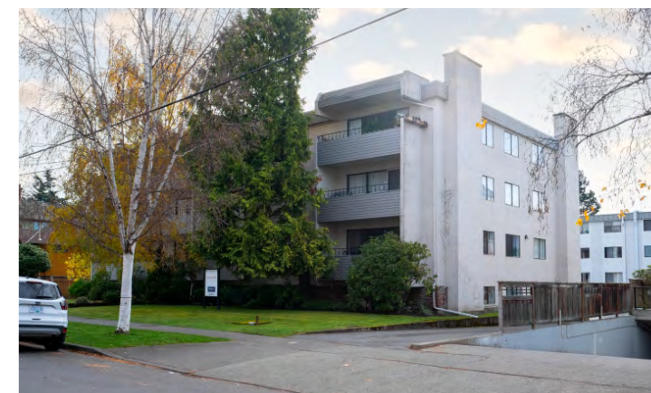
WEST SIDE OF BUILDING