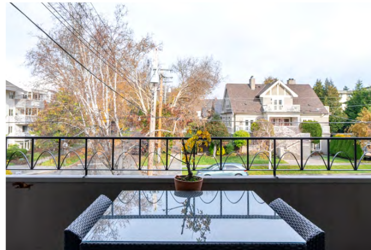
SUITE - BALCONY