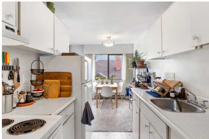
SUITE - KITCHEN