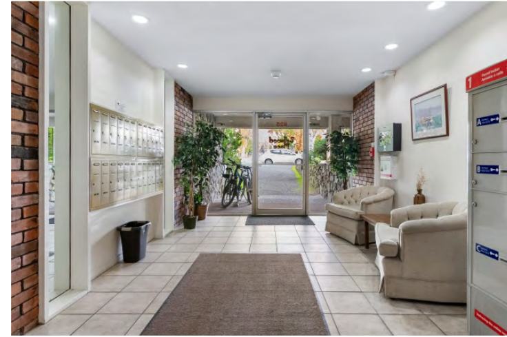
COMMON AREA - LOBBY