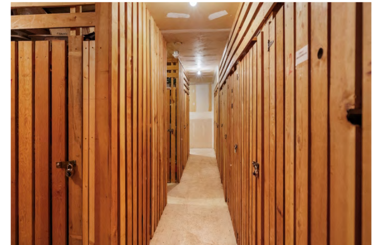
COMMON AREA - STORAGE