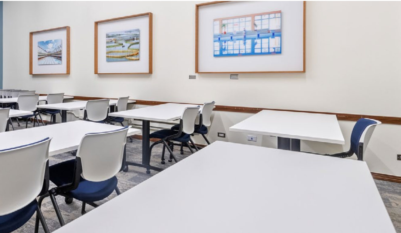
30 person training room