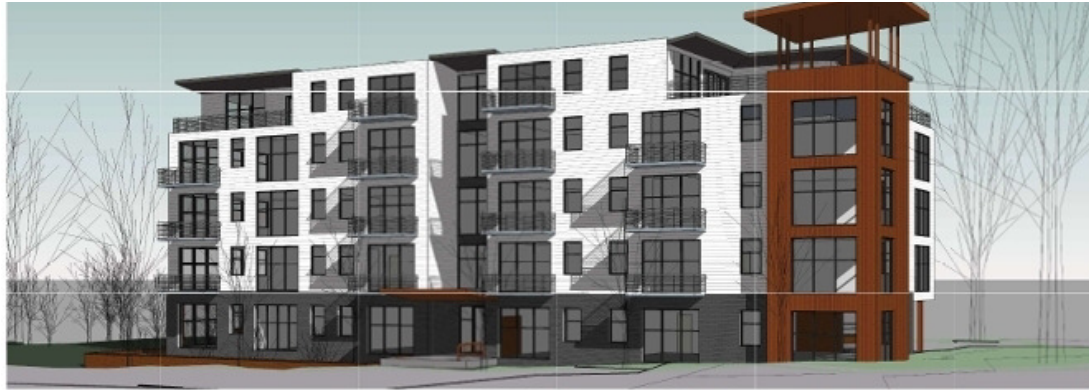
① PRELIMINARY PERSPECTIVE