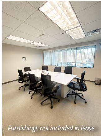
Furnishings not included in lease