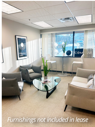
Furnishings not included in lease