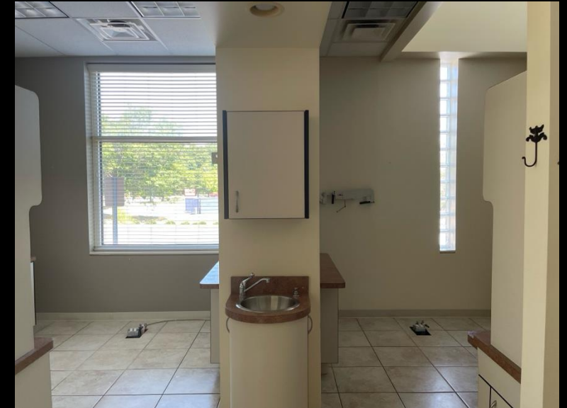
Interior - Exam