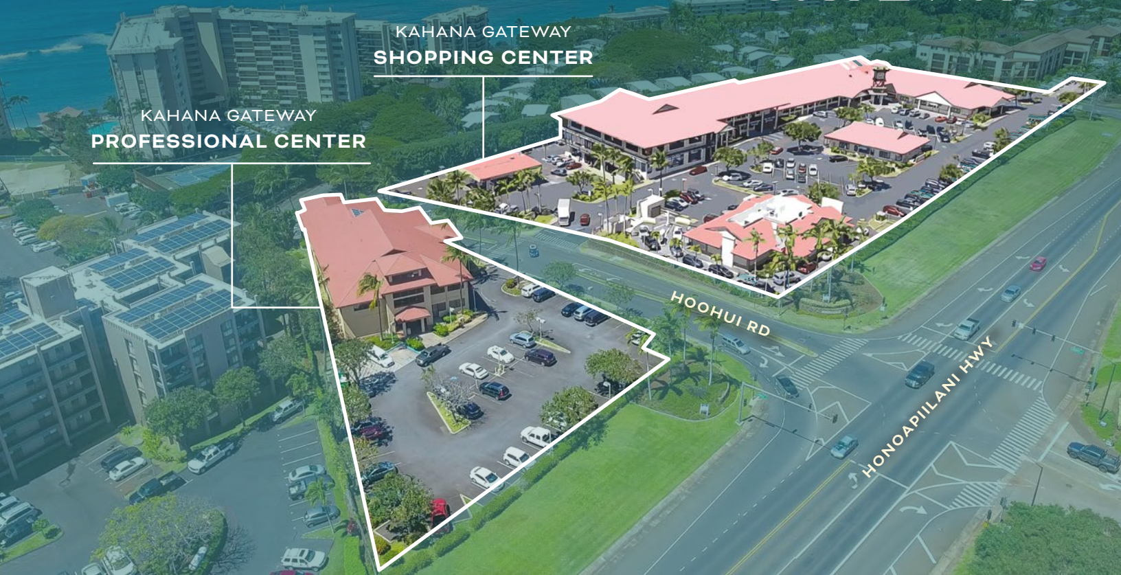
KAHANA GATEWAY SHOPPING CENTER