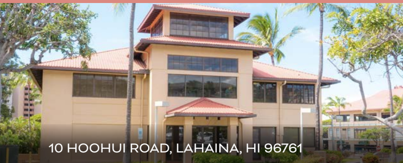
10 HOOHUI ROAD, LAHAINA, HI 96761