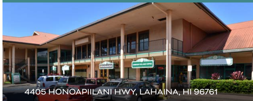
4405 HONOAPIILANI HWY, LAHAINA, HI 96761