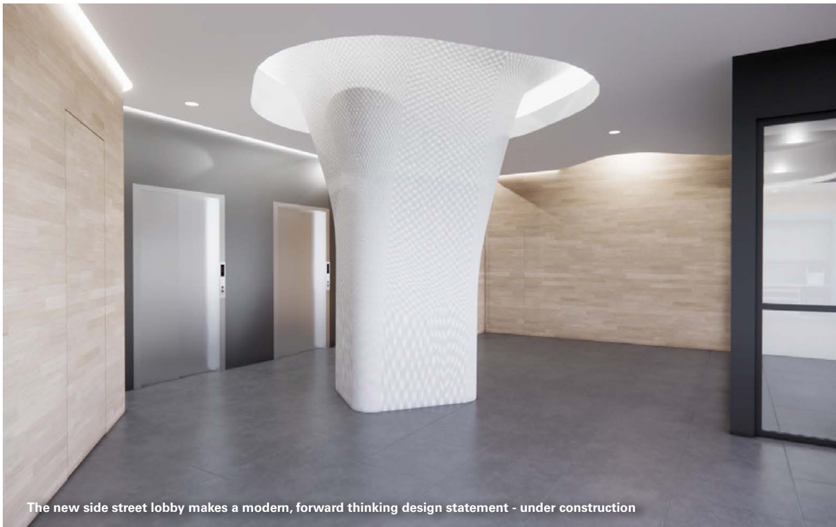
The new side street lobby makes a modern, forward thinking design statement - under construction