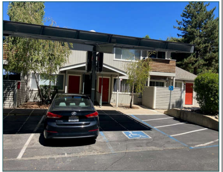
Front of Unit