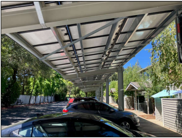
Carport with Solar