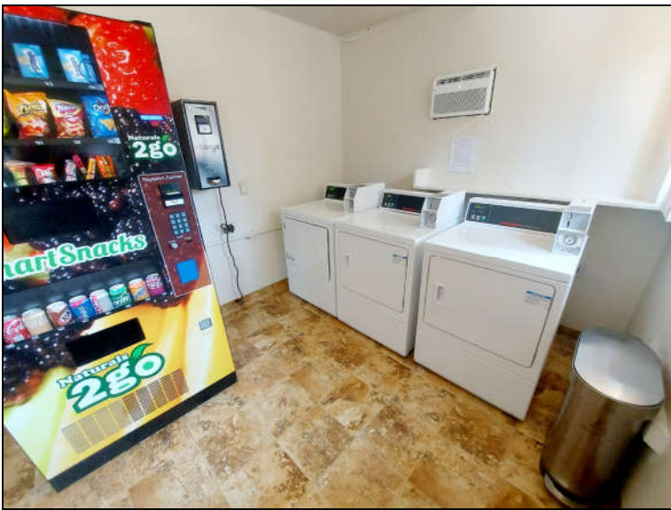
Laundry Room / Vending and Change Machine