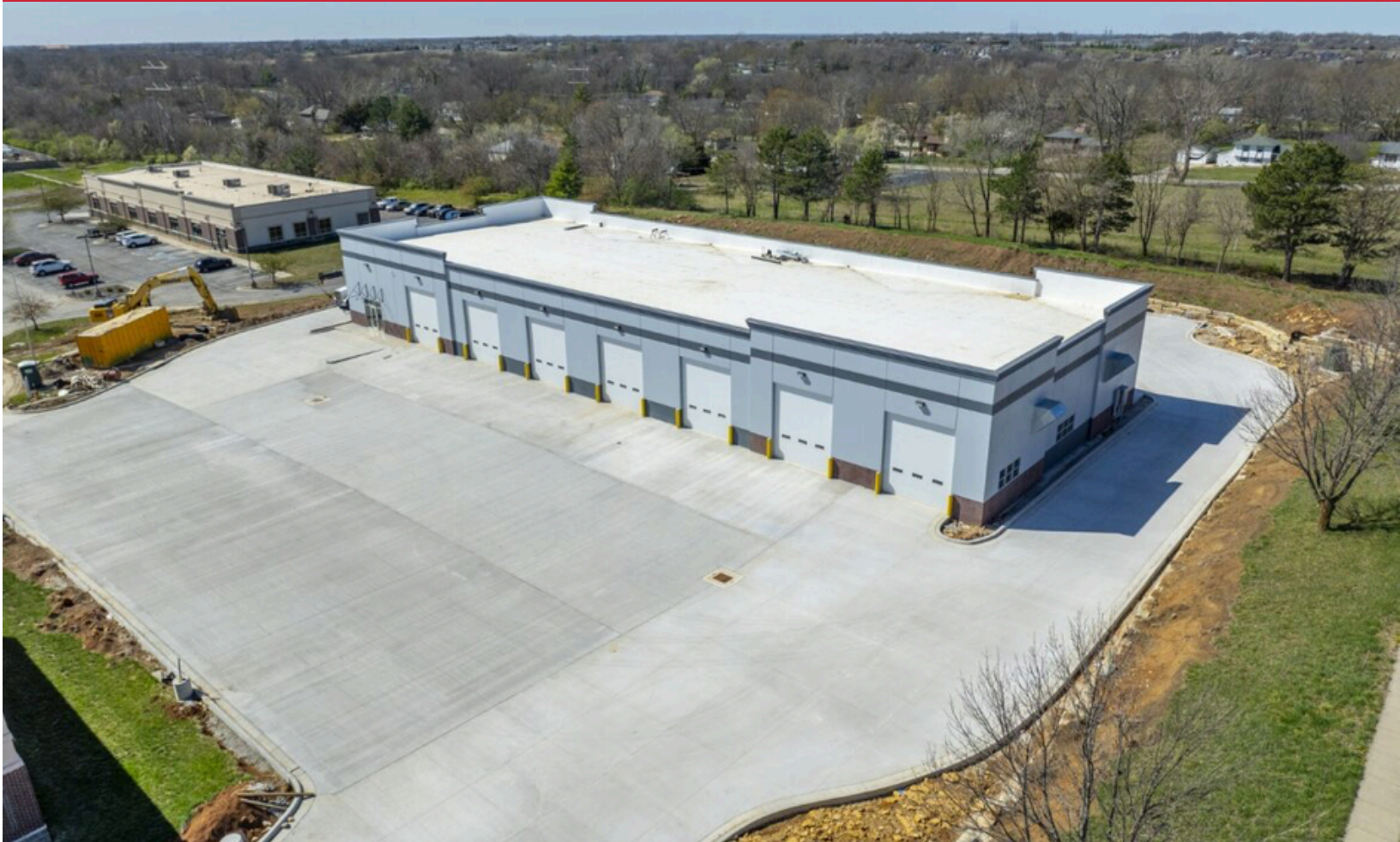
New Construction Truck Service & Maintenance Facility 7 Drive Through Bays