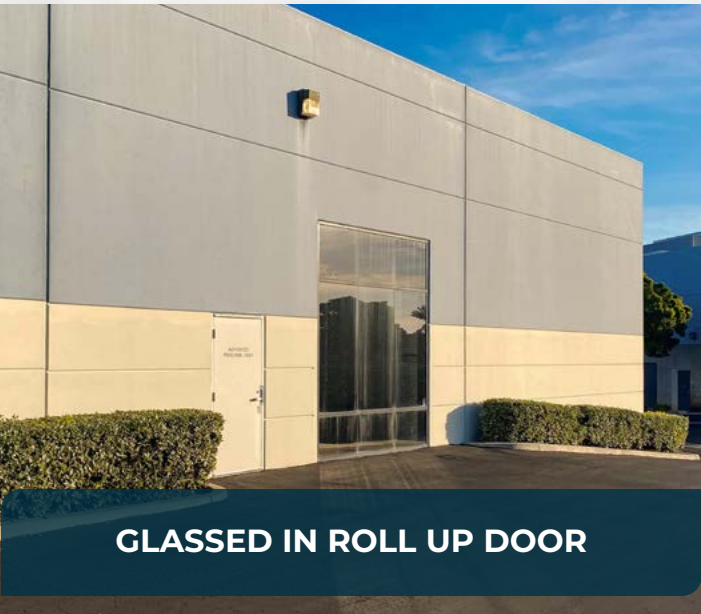
GLASSED IN ROLL UP DOOR