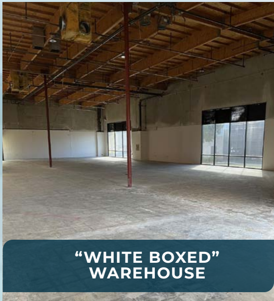
"WHITE BOXED" WAREHOUSE