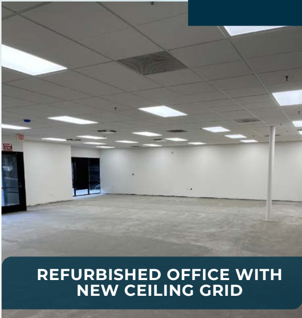
REFURBISHED OFFICE WITH NEW CEILING GRID