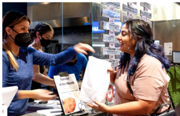
LOYAL CUSTOMER BASE