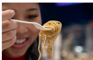
VARIETY OF CUISINE