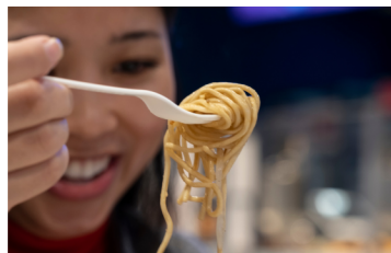
VARIETY OF CUISINE