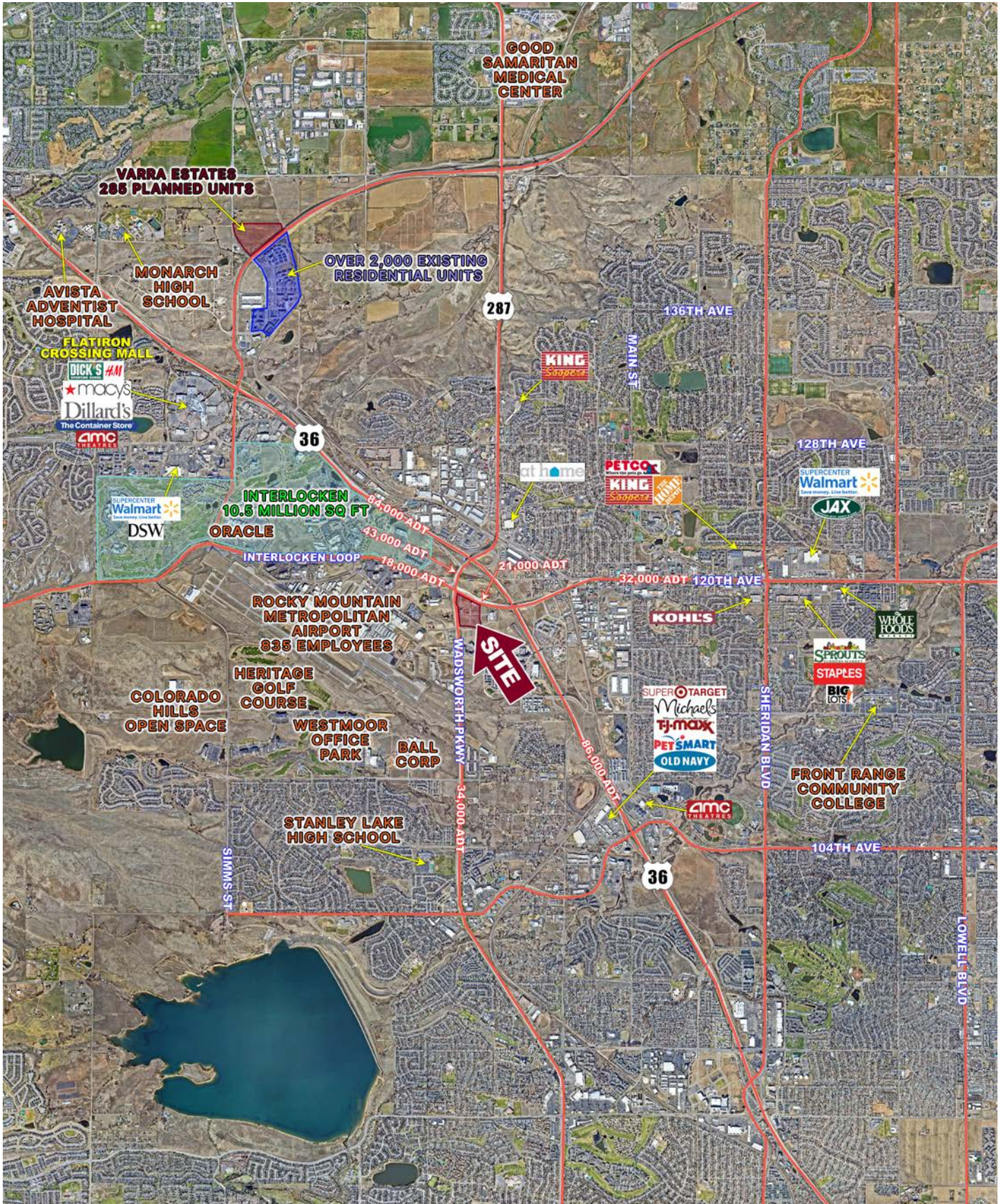
MAP COURTESY OF GOOGLE EARTH 2022

Wadsworth Pkwy & 120th Ave | Broomfield, CO