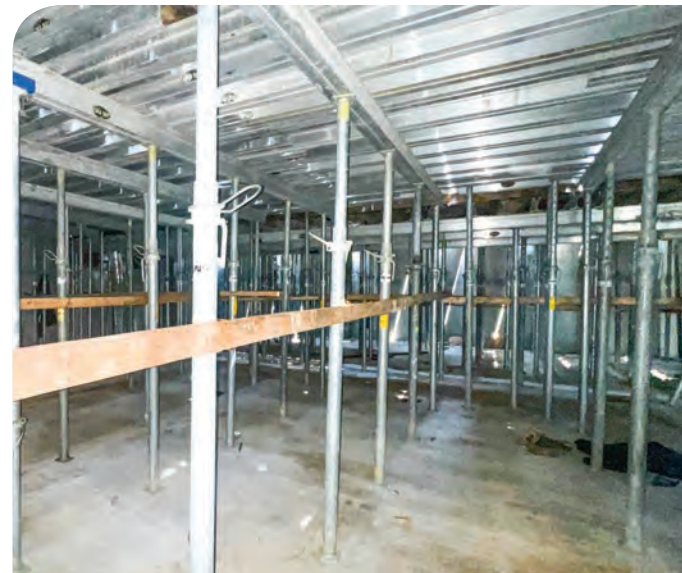
Subterranean Parking Level