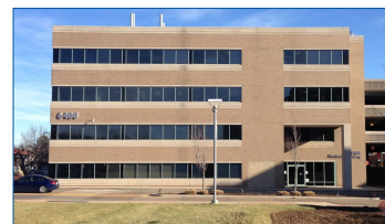
6400 Clayton Road