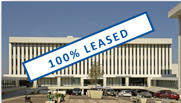
1031 Bellevue Avenue