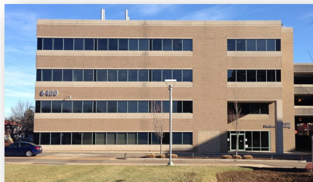
6400 Clayton Road