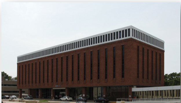
1035 Bellevue Avenue