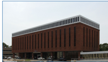
1035 Bellevue Avenue